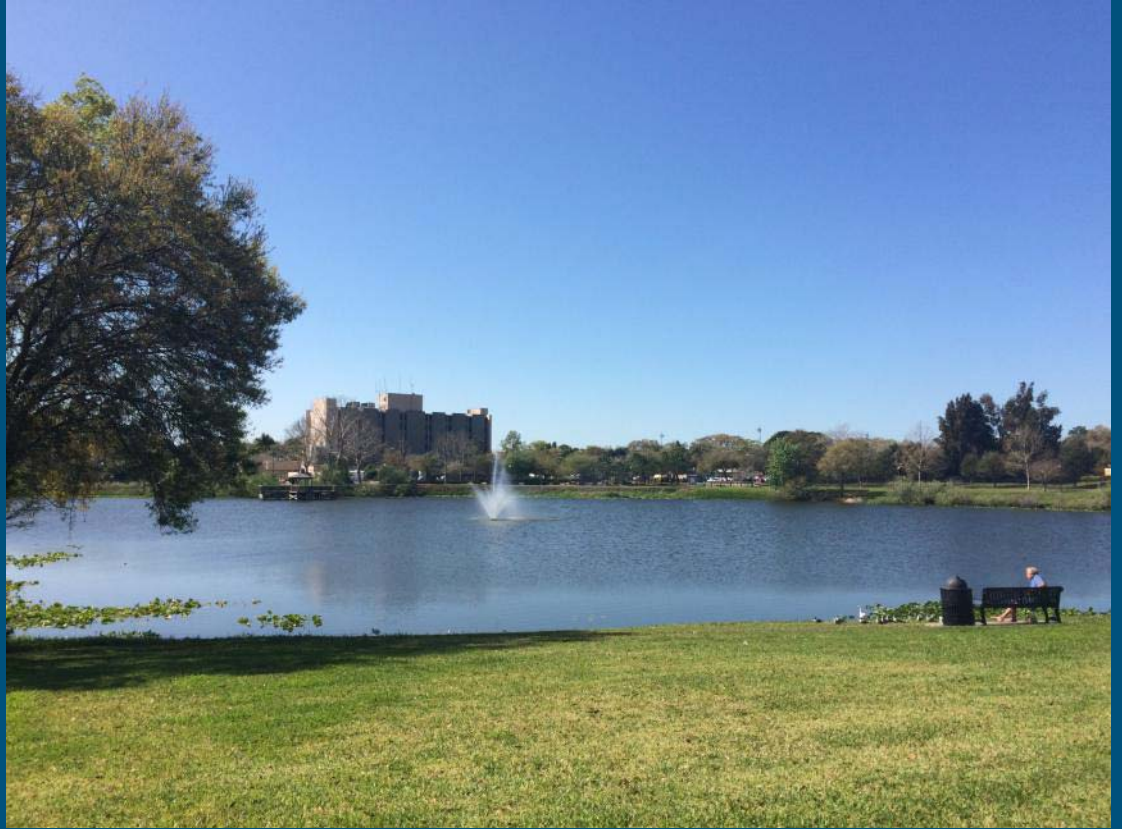
Booker Creek Neighborhood