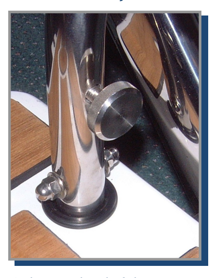
A close-up detail of the innovative handrail stanchion-clamp. Note the delrin socket to receive the self-clamping stan-