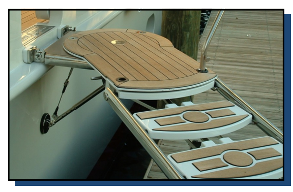
Top: Rotation Platform; allows the stairway to rotate 160°