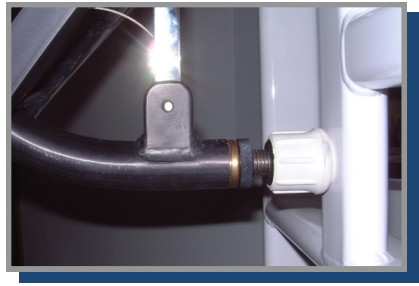
A close-up detail of the in-field adjustable leveling standoff. Our design protects the crutchtip from damage and requires no tools for fine adjustment.